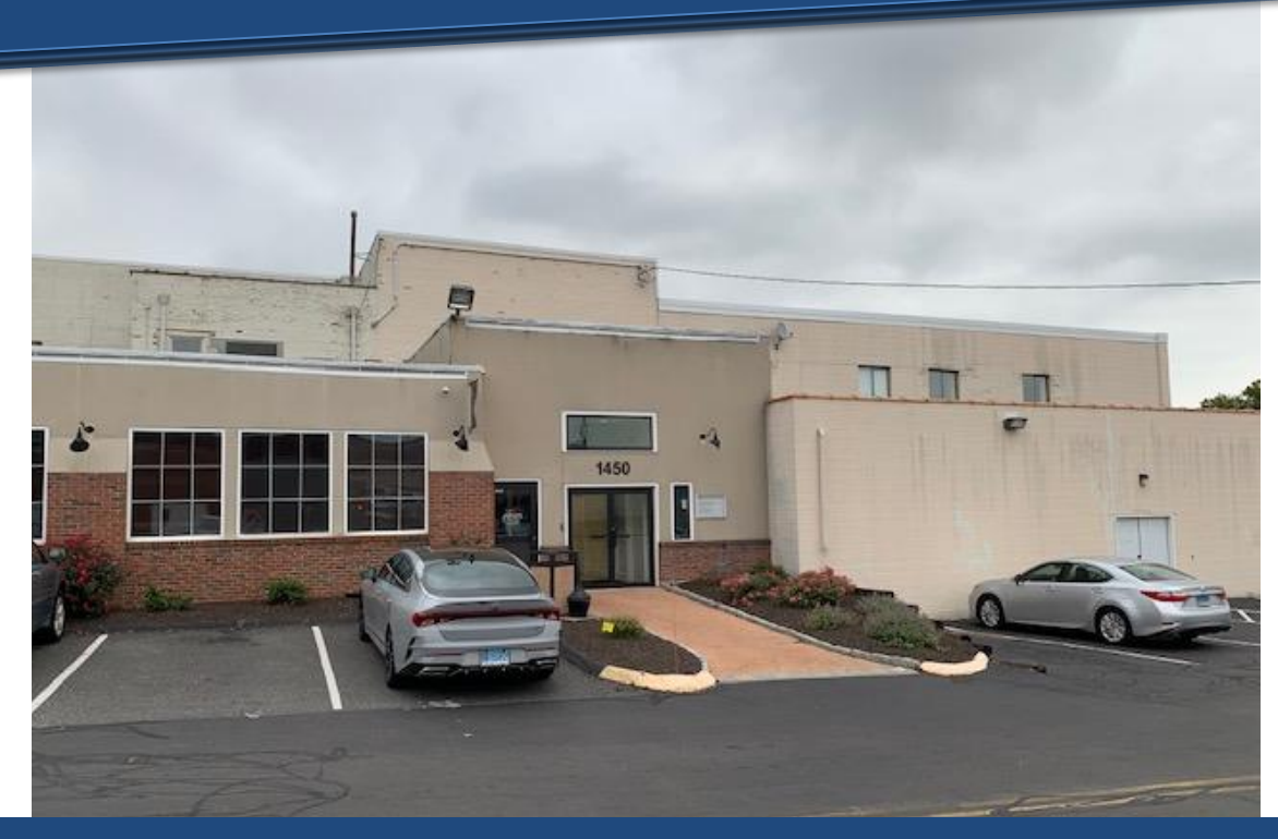
1450 Barnum Avenue, Bridgeport, CT

For additional information or to request a showing please contact the Exclusive Agent Joel Hausman: 203-367-4087 ext. 3 jhausman@colonialrealty.net