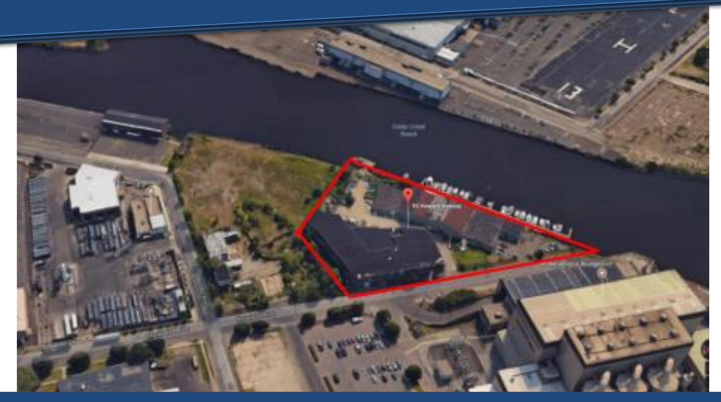
82-92 Howard Avenue, Bridgeport, CT

For additional information or to request a showing please contact the Exclusive Agents David Flayhan: 203-307-0785 ext. 1 Cell: 203-858-2437 dflayhan@colonialrealty.net David Gorbach: 203-367-4087 ext. 2 dgorbach@colonialrealty.net