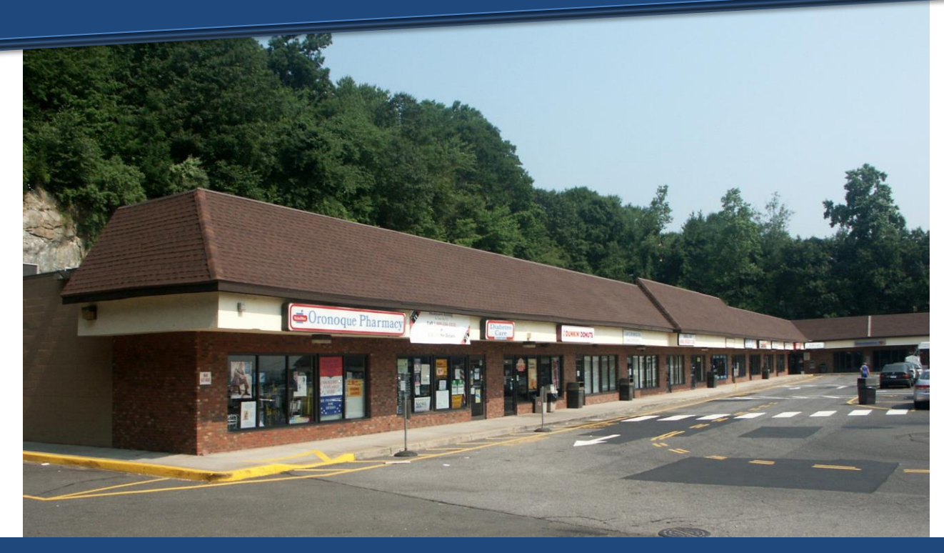
7365 Main Street, Stratford, CT

For additional information or to request a showing please contact the Exclusive Agent Read Auerbach: 203-451-7047 rauerbach@colonialrealty.net